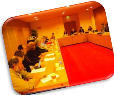
IFLA SET Standing Committee Members 2014