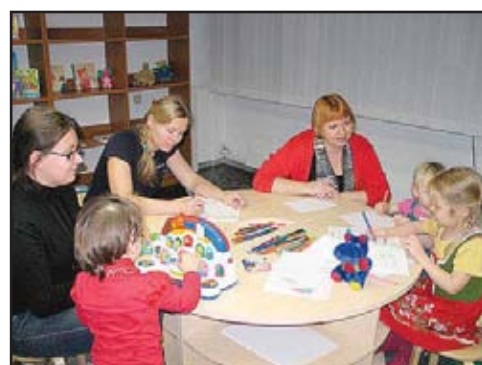
Tartul (Esontia) University Library

1.b To program and coordinate activities in order to reinforce the current motto "Libraries on the Agenda".