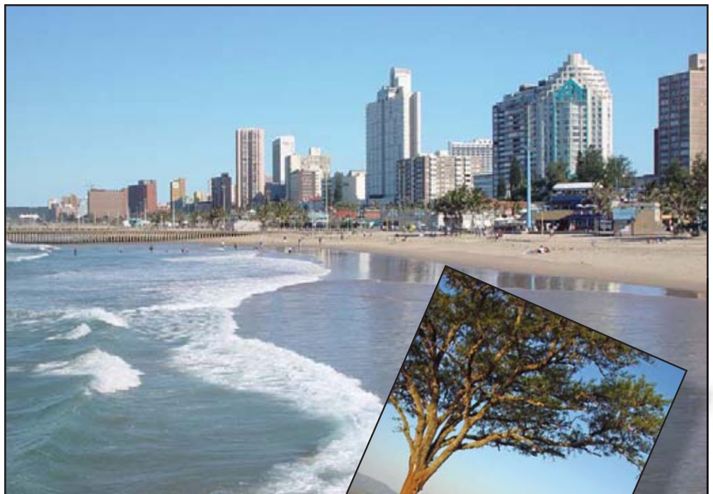
Durban, South Africa