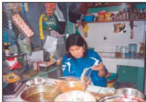
Biblioteca Comunal de Santa Cruz (Peru)

• Potential for generating widespread public visibility and support for libraries, irrespective of the kind or amount of resources employed