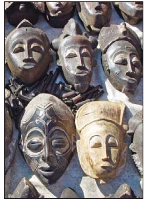
Masks, South Africa