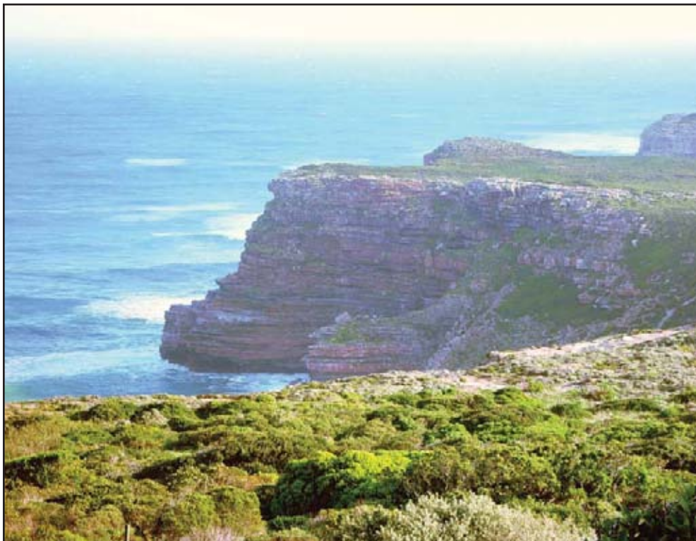
Cape Of Good Hope, South Africa