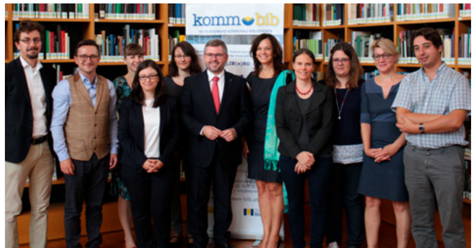
Final conference of LIB(e)RO in the State Library of Lower Austria September 2018.

If you are looking for more information about our project and/or our project partners, you can visit us on our website [ http://libero.uni-passau.de ]