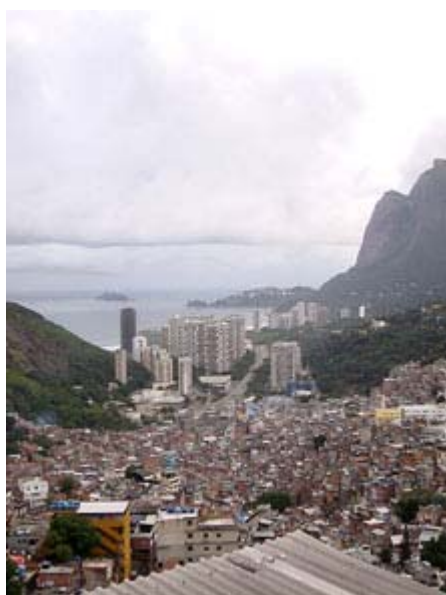
Rocinha and Sao Conrado