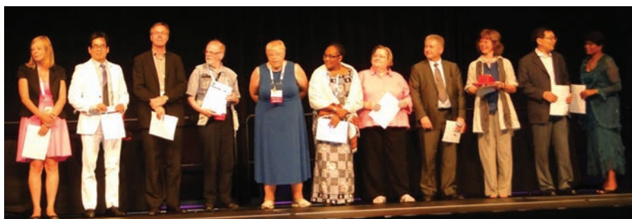
Retiring Governing Board members during closing session