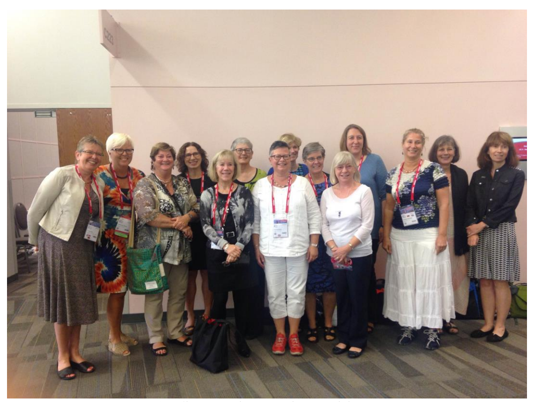
Standing committee meetings participants