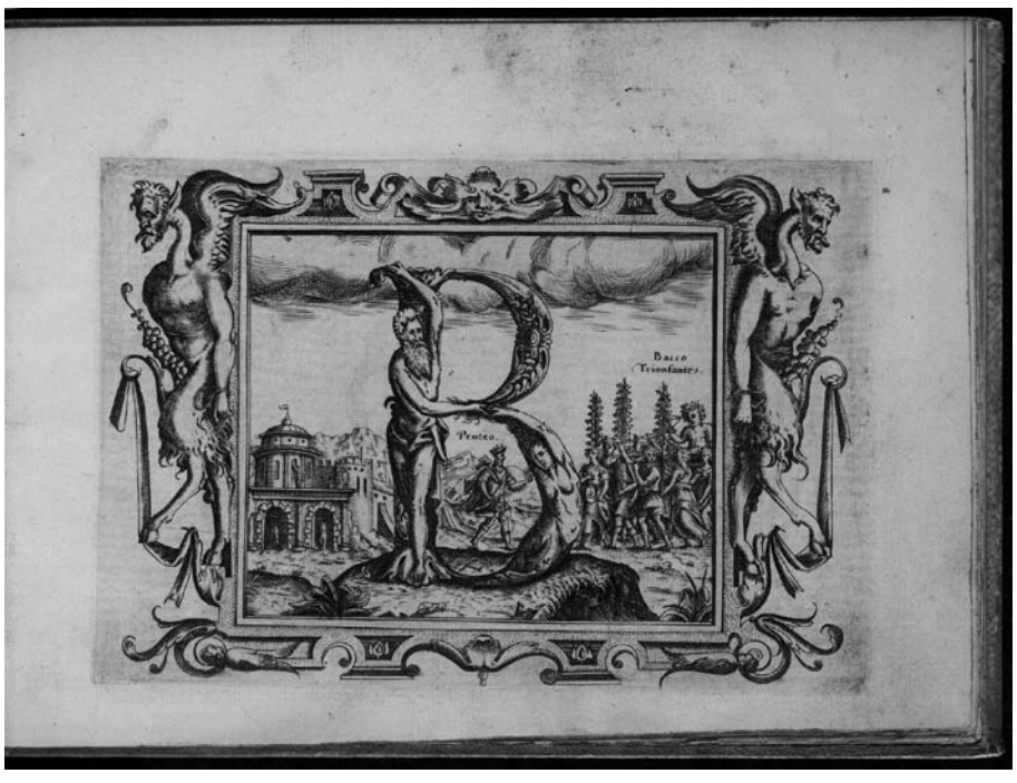
I. Paulini, Letter B with Pentheus, and Bacchus on a Triumphal Car, engraving in Alfabeto (Italy, ca. 1570 or later). Gift of the Research Library Council, Research Library, The Getty Research Institute, Los Angeles, 2729-626. [Filename: P25220 PART OF 2007 A2 LETTERB.JPG]