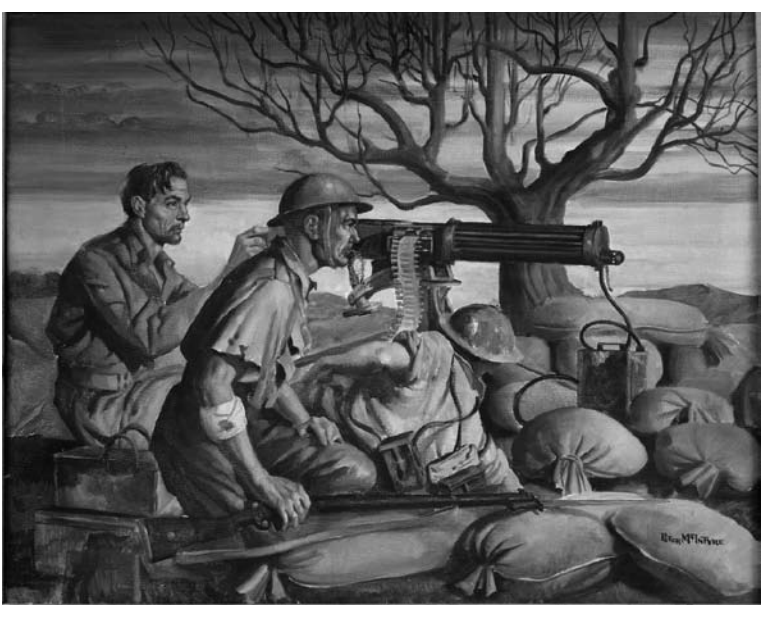
Peter McIntyre, The alert at dawn, 27th Machine Gun Battalion in Greece, April 1941, Archives New Zealand Te Rua Mahara o te Kāwanatanga, [Ref. AAAC 898 NCWA 12]