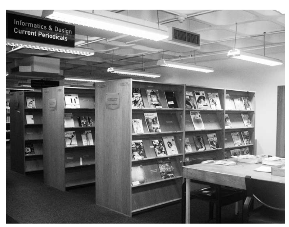
The Cape Town Campus Design Library of CPUT.

CPUT is therefore very much in transition as a result of the merger, and this is reflected in the library. The Informatics and Design Faculty Library is situated on the Cape Town and Bellville Campuses, approximately 50 km apart, and are two of seven campus sites. Early in next year there will be another site a few kilometers