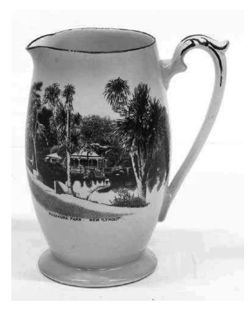
Hollinshead & Kirkham Ltd, Milk jug, Puke Ariki and District Libraries, [Ref. TM2002.218]