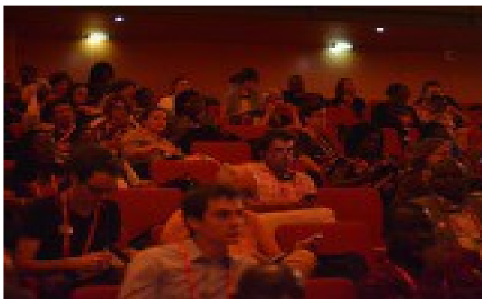
OPEN FORUM (Joint Forum with IFLA Section on Children and Young Adults).

http://conference.ifla.org/ifla80/node/407