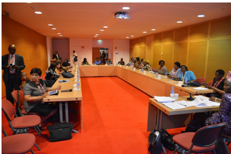
Africa section Meeting