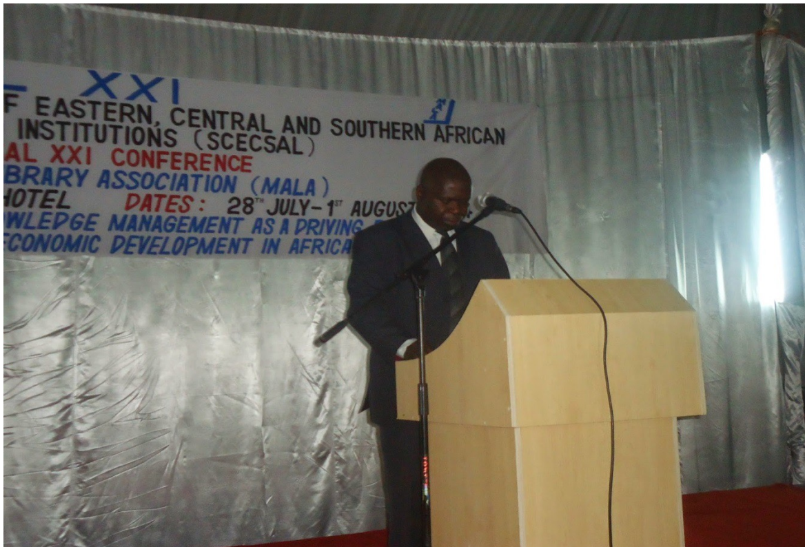
Dr Emmanuel Fabiano, Minister of Education, Science and Technology at the Opening session

Done, this 1st Day of August 2014, at Sunbird Capital Hotel, Lilongwe, Malawi.