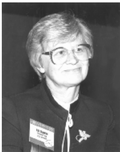
Figure 2. Else Granheim, President 1979–1985.

Difficult decisions concerning participation by various national library associations had to be made by the Executive Board at various times. In 1981 the People's Republic of China was admitted as a member, but this had required the membership of library associations of the Republic of China (Taiwan) to be suspended in 1976, although not the memberships of individual libraries. The South African Library Association was suspended as a member in 1972 but individual libraries in South Africa continued as Institutional members. Following an IFLA fact-finding mission in 1993, the Library and Informa-