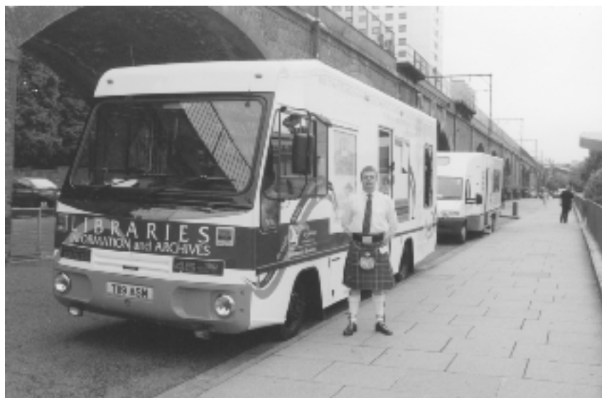
Figure 1. A mobile library from Dumfries and Galloway, Scotland.

IFLA 2002 is very much a British event held in Scotland, and it is a constitutionally devolved but united information profession that welcomes you to Britain. The United Kingdom has a vast range of library and information organizations. Briefly, there are six legal deposit libraries each of which is entitled to receive, free of charge, a copy of every work published in the United Kingdom and the Republic of Ireland. These libraries are, the Bodleian Library Oxford, Cambridge University Library, the National Library of Scotland, the library of Trinity College Dublin, and the National Library of Wales. The sixth organization is the British Library, which has its own Legal