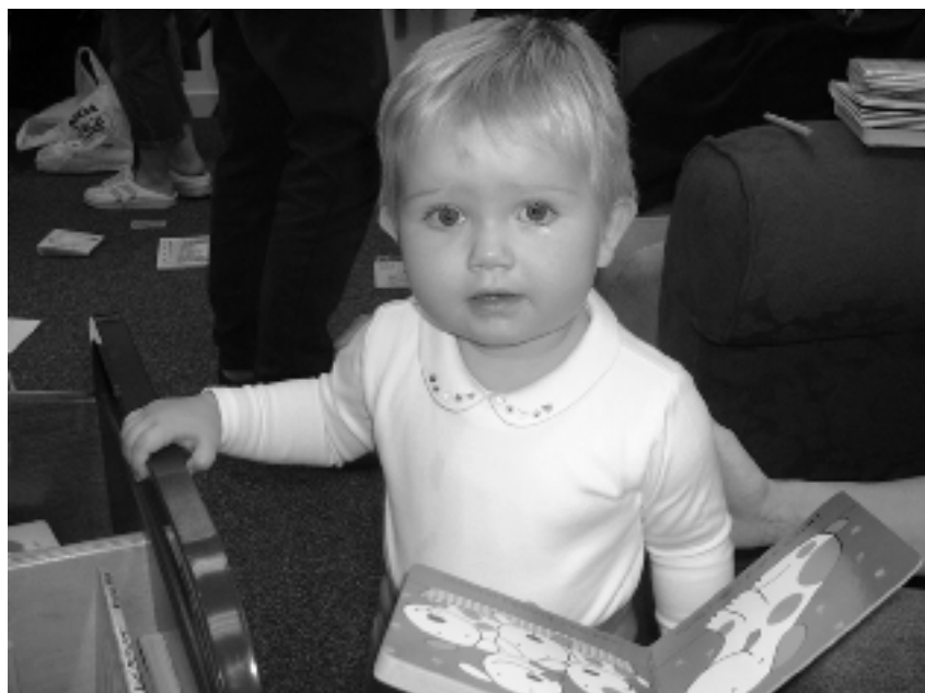
Figure 16. A magical world for little people: the Sunshine Library, Wakefield.

Today the style of language, the Queen, and the Association may be different but the sentiments remain the same. The future efforts will be no less as the British library and information world embraces the challenges and opportunities of the new millennium.