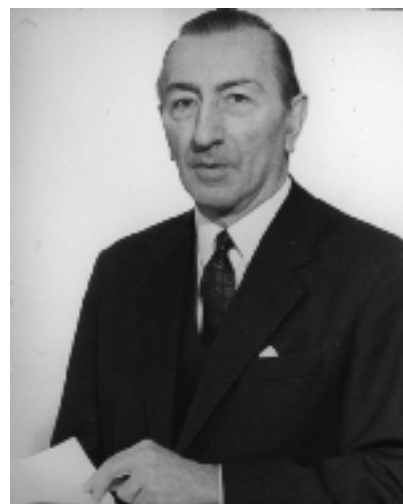
Figure 7. Gustav Hofmann, President, 1958–1963.

The International Conference on Cataloguing Principles, Paris (1961)