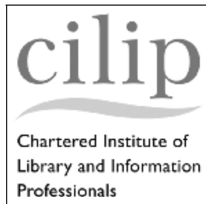
Figure 2. The CILIP logo.

The Consortium of University Research Libraries (CURL) is a group of research libraries which seeks to 'promote, maintain and improve library resources for research in universities'. Also in the academic sector is the M25 Consortium of Higher Education Libraries. This was set up to foster cooperation between the 38 universities enclosed or served by the M25 London orbital motorway from which it takes its name. Two familiar networks, Electronic Access to Re-