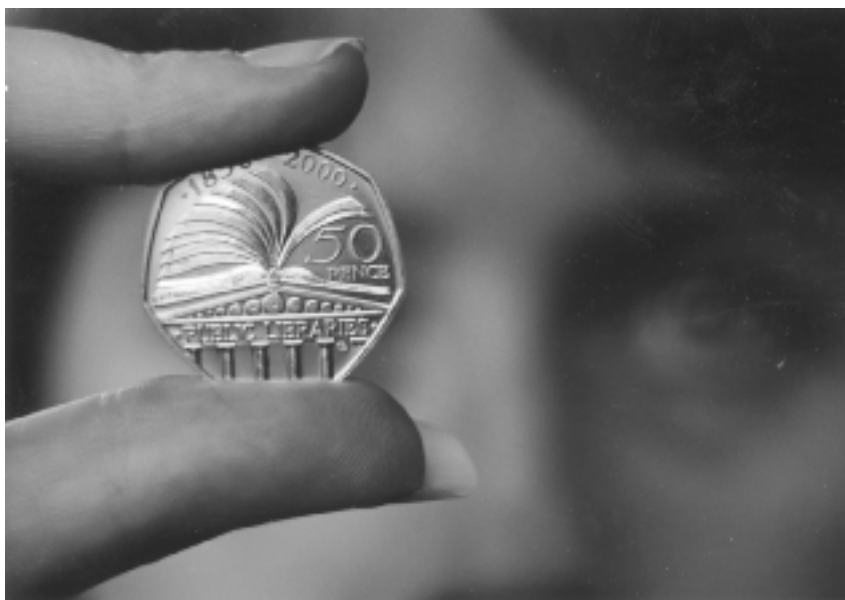
Figure 11. The coin commemorating 150 years of public library legislation.

sustained by the Blair (New Labour) government. The concepts of 'Best Value' in local government, and the Quality Assurance Agency's Subject Reviews in the university sector have had considerable implications for library and information services. 'Best Value' represents a strategy for ensuring local government provides high quality services which meet users' needs at the lowest cost. Adverse reports by Best Value inspectors have resulted in the 'early retirement' of some Chief Librarians and in one instance private consultants were called in, albeit on a temporary basis, to run a public library service