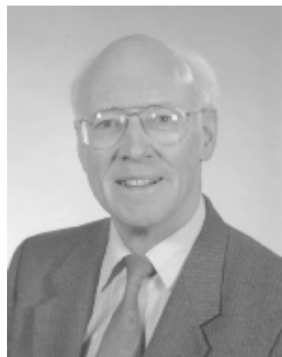
Figure 3. Maurice B. Line first Director, UAP Programme

A further Core Programme, Preservation and Conservation (PAC) was launched in 1986 with its focal point in Washington, DC. It moved to the Bibliothèque Nationale in France in 1992. A Core Programme under the title Transborder Dataflow was hosted by the National Library of Canada, Ottawa in 1986. In 1988 it became Universal Dataflow and Telecommunications (UDT).