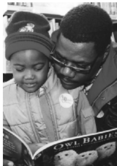
Figure 6. Encouraging family reading at an All Books for Children session.

In the academic library field there has been a steady stream of projects. The London School of Economics has a programme to digitize the Booth maps of London poverty at the turn of the 20 th century, while at the University of Kent a political cartoons collection has been successfully digitized. Another highly visual source, historic maps, has been the subject of a particularly important digital development. This project concerns the large-