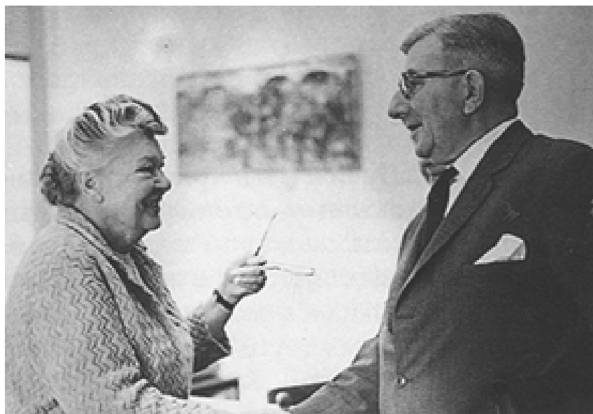
Figure 9. M.I. Rudomino and Sir Frank Francis (President, 1963–1969) (Moscow, 1972).

basis by enlarging the Advisory Committee.