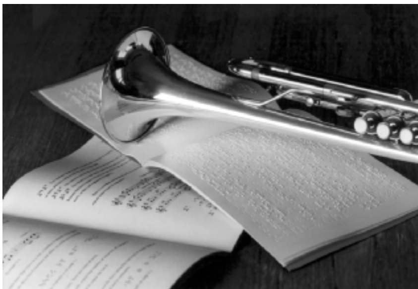
Figure 8. Music in Braille at the National Library for the Blind.

Since 1979 authors in the United Kingdom have, through the Public Lending Right (PLR) scheme, been able to receive payments for loans of their books from public libraries. The scheme makes use of sophisticated computer technology which, with the cooperation of public libraries, tracks loan data. Authors are paid at the rate of 2.67 pence per loan and are eligible for payment if their loan total reaches a minimum of GBP 5.00. There is a payment limit of GBP 6,000. It is important to note that this funding comes from central government and not from libraries. Since the scheme started it has distributed nearly GBP 71 million to authors. For the first time this year European writers will qualify for payment under the UK scheme. The scheme has been extended with a