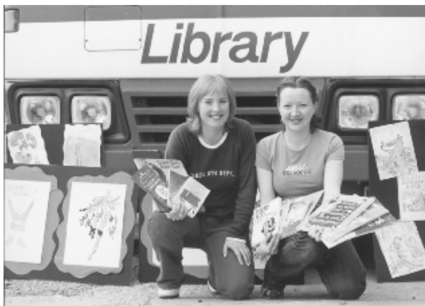
Figure 4. Libraries Change Lives: Boox on the Move, Leeds.

Paper, The Learning Age , focused on the economic, socio-political and individual advantages of life-long learning. (Department for Education and Employment 1998). While it was criticized for not clearly explaining the role of libraries, it was evident that the learning age would have to be supported by a library and information network that enabled access to the National Grid for Learning.