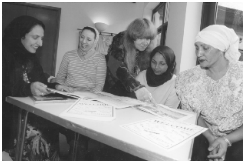
Figure 3. Libraries Change Lives: The London Borough of Merton's Refugee Resources Collection and Service.

In essence the report points to the need for public libraries to become active partners in the development of electronic networks, both as points of access and providers of content and services. Building the New Library made recommendations on how that vision was to be turned into reality. It advocated a rapid action programme to equip librarians with new skills, proposed a network based on the Internet, and put forward a framework for managing resources on the network and creating digital content. Many similar ideas could also be found in Connecting the Learning Society: The National Grid for Learning (Department for Education and Employment 1997). This stressed the importance of the Internet in supporting teaching, learning, training and administration and emphasized the impact on libraries brought about by the 'quality and quantity of new and existing information and knowledge'. A Green