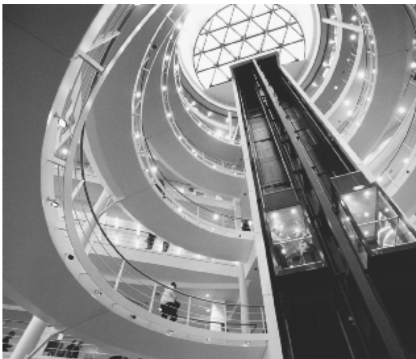
Figure 15. Exciting architecture at LSE's Lionel Robbins Building.

UK local authorities spend in the region of GBP 850 million a year on public library services. University and Higher Education Libraries cost around GBP 417 million a year. LISU reports that total public library spending rose by 4.5 percent in 2000-01 and predicts a greater rise of 6.6 percent in 2001-02. The National Lottery contributes to the library service via the New Opportunities Fund (NOF). The government gave GBP 200 million to the New Opportunities Fund (NOF) to promote community access to life-long learning. This included GBP 20 million to train public library