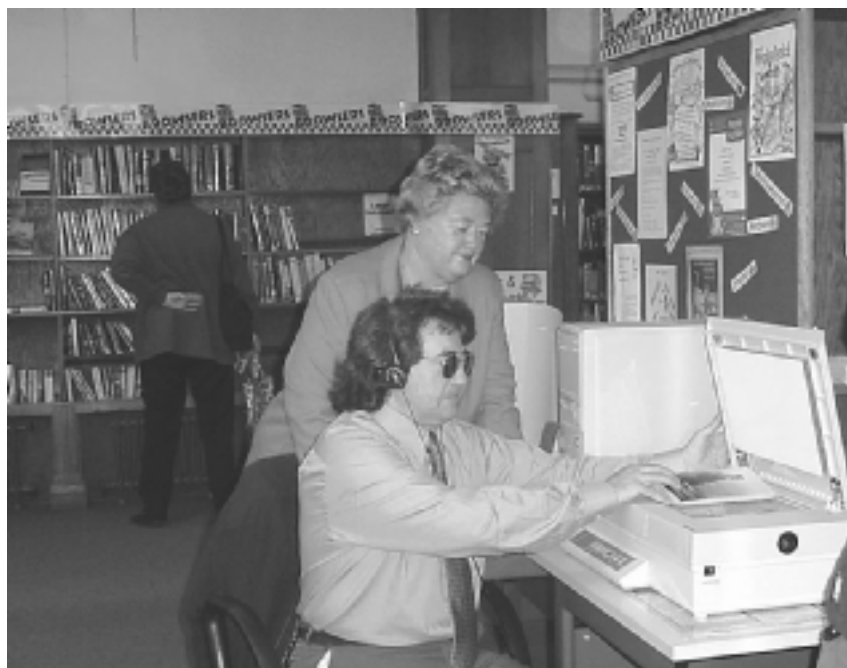
Figure 9. Demonstrating an automatic reading machine for visually-impaired people at the Drury Lane Library, Wakefield.

volunteering. In February 2001 the Chancellor of the Exchequer promised GBP 120 million for volunteers in public services.