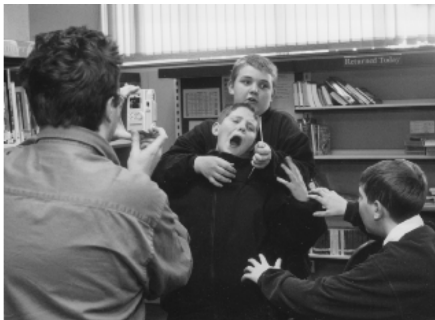
Figure 5. Libraries Change Lives: A Youthbox graphic workshop, Kensal Library, London.