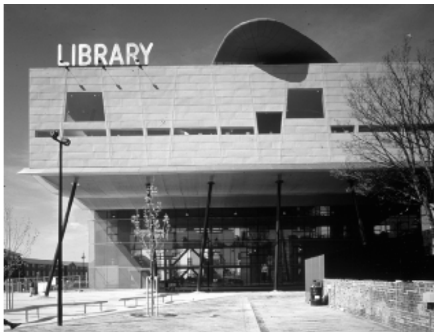
Figure 13. A library at the heart of the community: the Peckham Public Library.