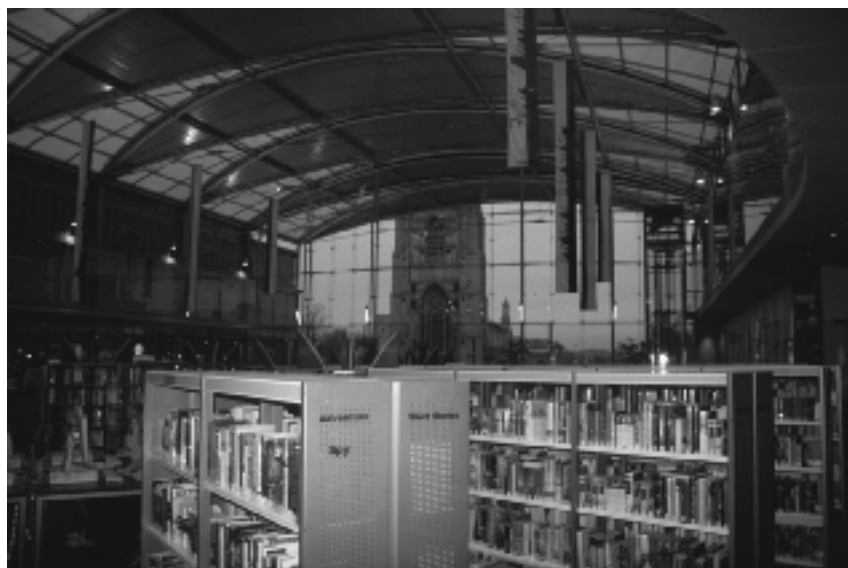
Figure 14. Stunning views all round at the Norfolk and Norwich Millennium Library.

councils (particularly the Economic and Social Research Council) in addition to the AHRB, and there is some danger that it can fall between these various stools. The Library and Information Research Group (LIRG) is an independent professional body that seeks to raise the profile of LIS research via promotion of research methodologies and results, awarding prizes for student dissertations and through its journal, Library and Information Research News .