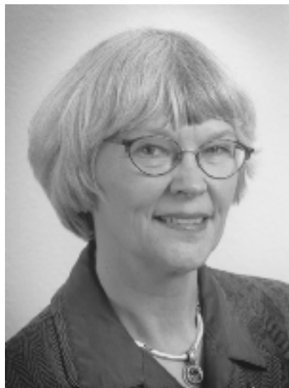
Figure 12. Birgitta Bergdahl, first Director of the ALP Programme.